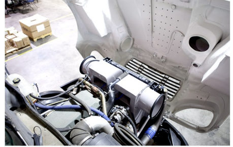
CUSTOM HOOD DESIGN TEMPLATE