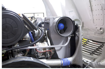
HIGH CAPACITY ELECTRIC FAN SYSTEM