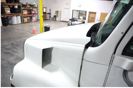
CUSTOM TEMPLATE HOOD DUCTING